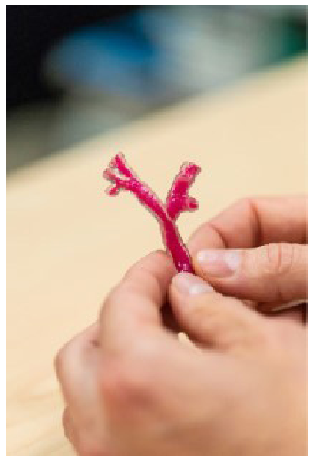
3D Printed Airway

The ability to digitally design a complex patient-specific airway, and then print it, not only allowed for a detailed virtual surgical planning session, but also the ability to rehearse as a team — which gave everyone confidence that the surgery would be successful. "That very first step of dividing the windpipe is something you can't walk back from," Johnson said. "You need to know exactly where to cut and at exactly what angle."